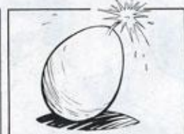
EGG-SPLORION? That's what hap- pened when 36 eggs were placed in a microwave by the Klingster's convincing child! Police say if they hadn't left their kitchen, the yolk would have been on them!

Luckily, the Klingsters left the kitchen to answer the doorbell—only seconds before the deadly breakfast exploded. The erupting eggs made