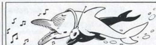
RHAPSODY OF THE DEEP? Gondoliers say they sing for these friendly flippers—and not for tourists!