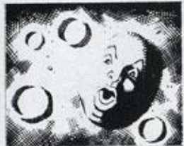
A FACE ON THE FACE OF MARS? Martian monolith smiles for the camera of Viking 1 space probe in 1977.

A RUSSIAN SPACE PROBE has sent back actual re-touched photographs of an ancient intergalactic Coney Island—on the surface of the planet Mars!