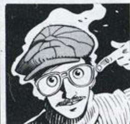
BOLT-BLASTED BRIT shows where lightning repaired his glasses.

Before his electric encounter, the witty Brit was so poverty-stricken that he couldn't afford to have his cracked bead ornament replaced.