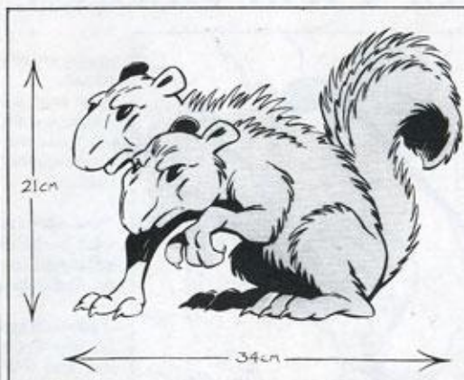
TWO HEADS BETTER THAN ONE? Not quite, say frightened folks, who fought off this furry freak.

A COUPLE CAMPING ON Mt. Rainier got a double dose of excitement when they were menaced by a vicious two-headed squirrel!