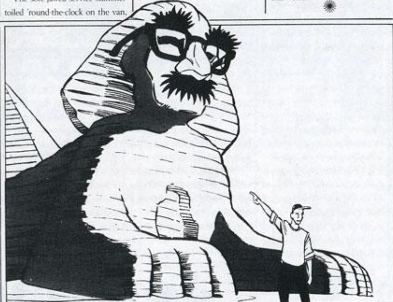
WHAT'S THE SECRET WORD? Jail. Or maybe even death. That could be the punishment for the students who changed history with giant Groucho glasses. No word on whether they planned to disguise the three pyramids as Harpo, Chico, and Zeppo.

"I'll bet their mileage is out-of-this-world!"