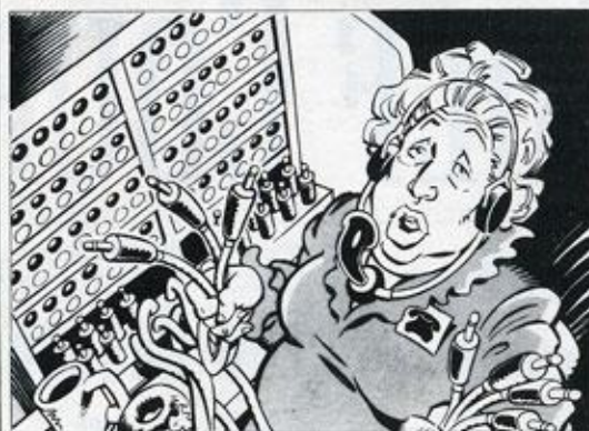
PHONE COMPANY PHONY? Some scientists think that phone workers like this are really space aliens!

THE PHONE COMPANY IS reaching out and touch- ing people everywhere —and leaving them with the L.O. of a turnip!