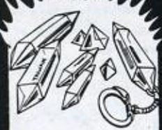
They Can All Be Yours With The Amazing