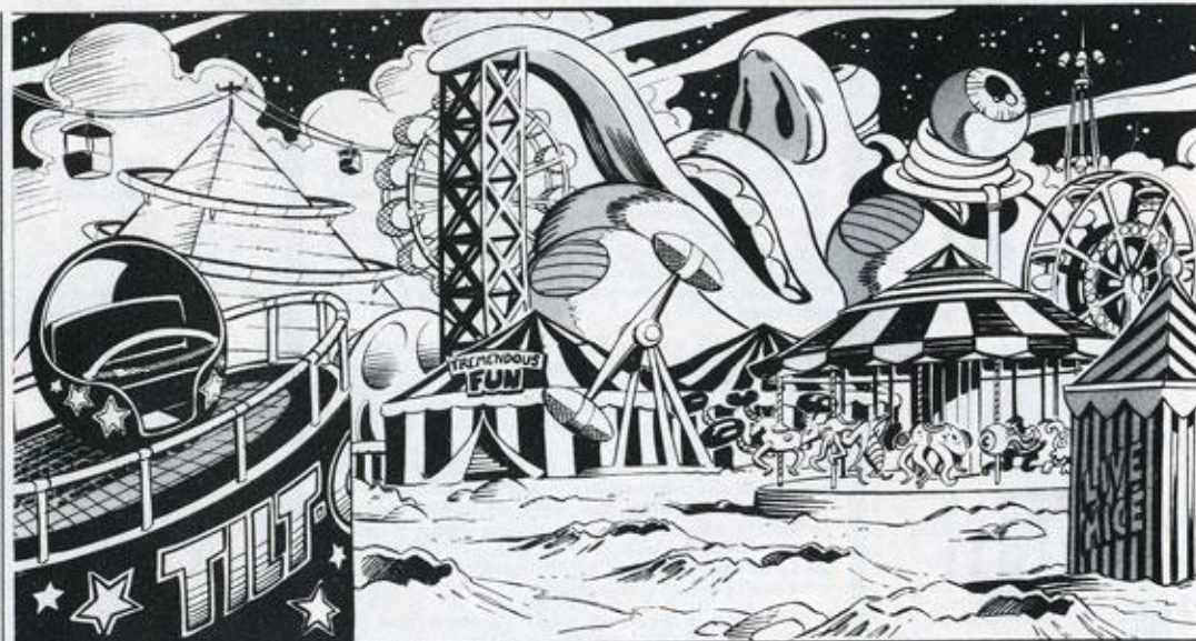
OUT-OF-THIS-WORLD amusement park looked like this, experts say.

But these new photos not only show the face in greater detail, they also show what appears to be a group of pyramids, with a railroad connect-