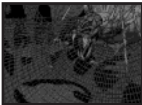
THE SPIDER ROOM