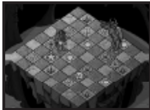
The Solitaire Room